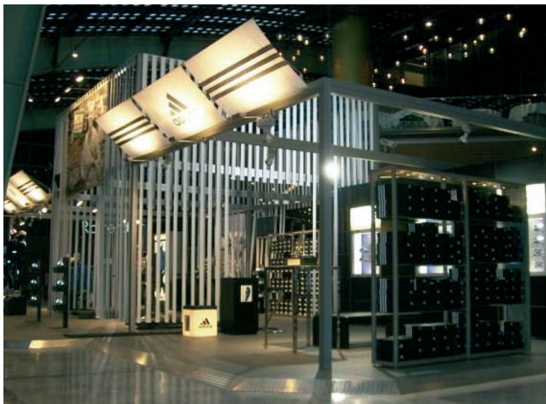
Adidas Rotterdam Marathon // 300m 2 2008 Rotterdam - Netherlands