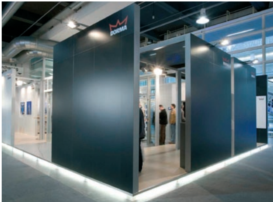
Dorma Sicherheit // 130m 2 2007 Zurich - Switzerland