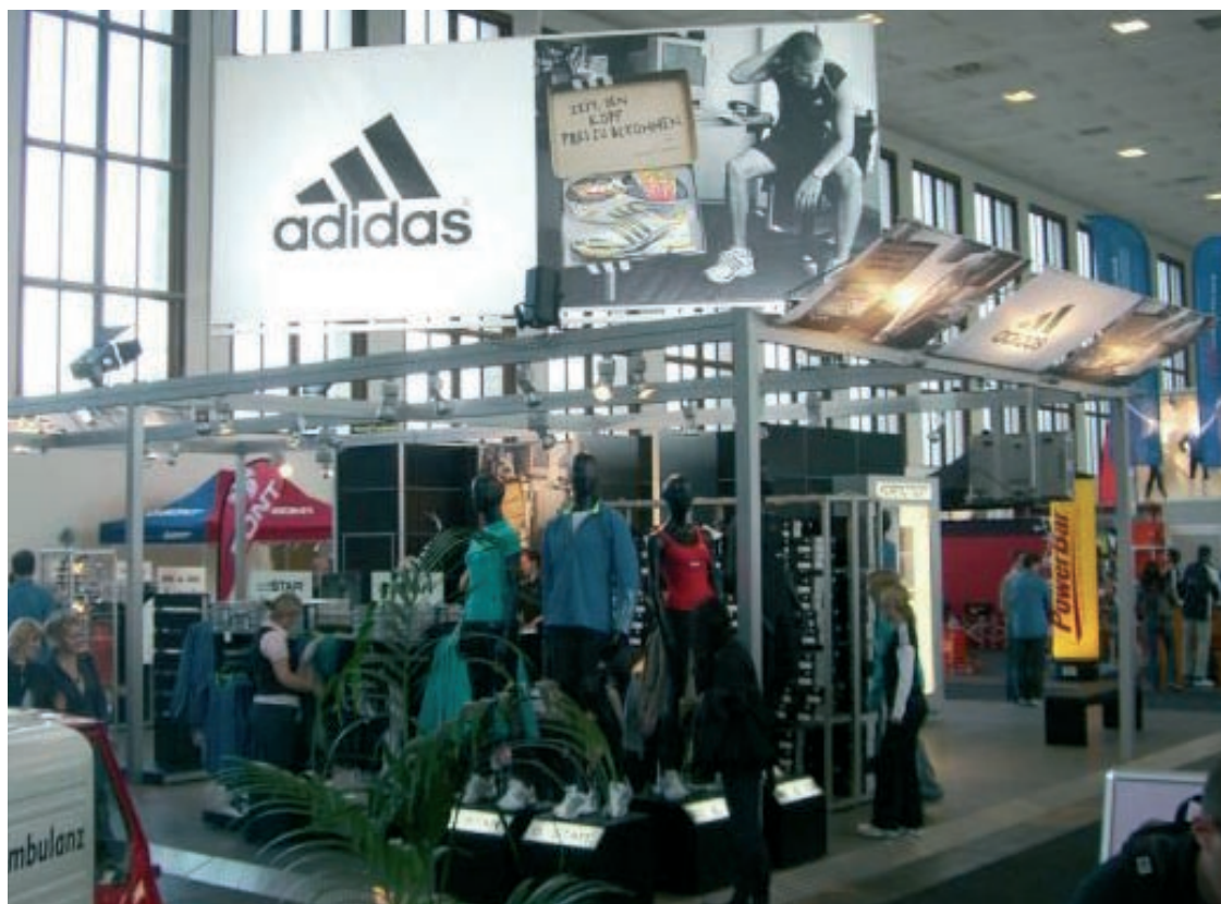
Adidas Halbmarathon // 120 m 2 2007 Berlin - Germany