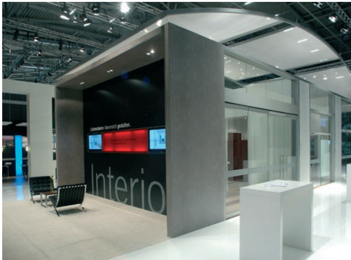
Dorma Bau Hall B1// 540 m 2 2009 Munich - Germany