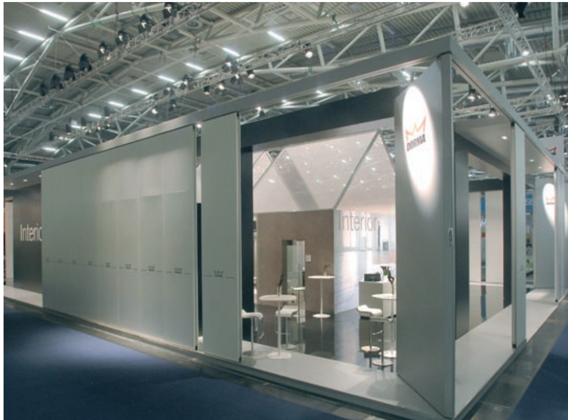
Dorma Bau Halle C4 // 400m 2 2009 Munich - Germany