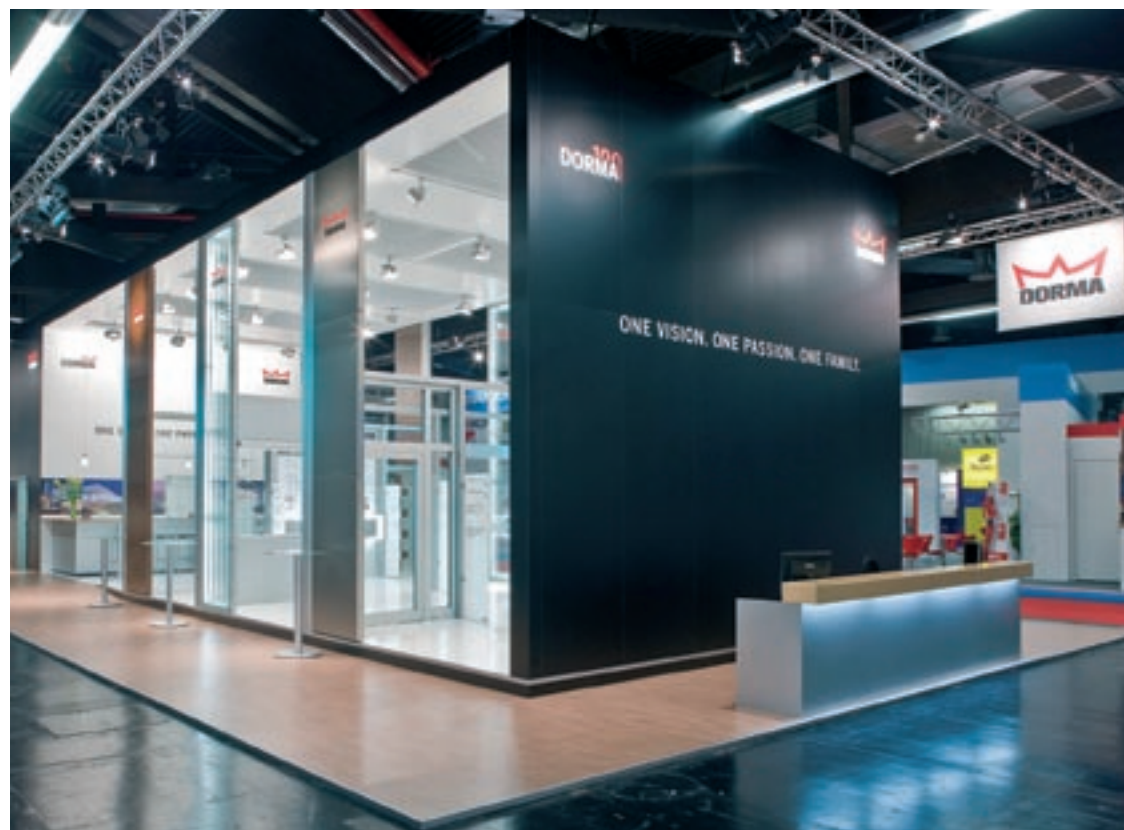
Dorma Fensterbau // 280m 2 2008 Nuremberg - Germany