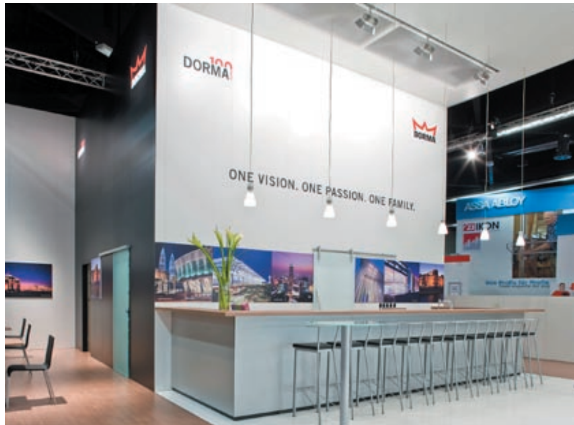
Dorma Fensterbau // 280m 2 2008 Nuremberg - Germany