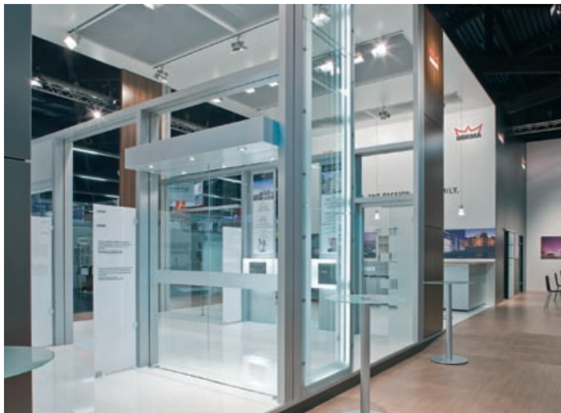
Dorma Fensterbau // 280m 2 Nuremberg - Germany