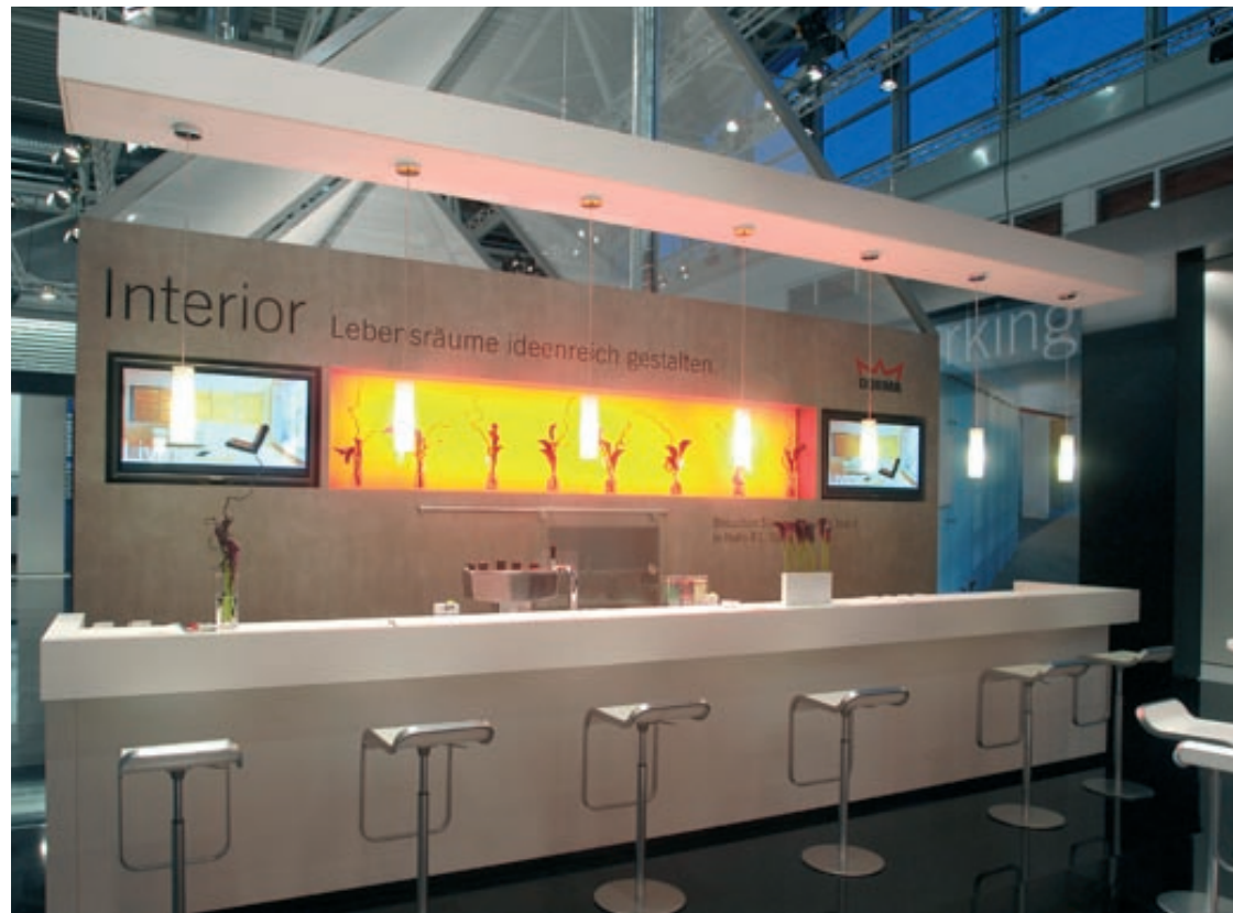
Dorma Bau Halle C4 // 400m 2 2009 Munich - Germany