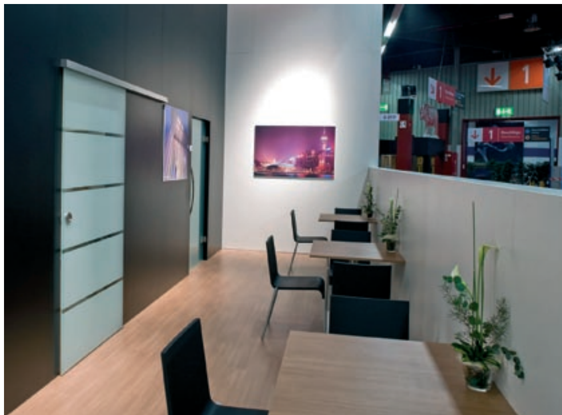
Dorma Fensterbau // 280m² 2008 Nuremberg - Germany