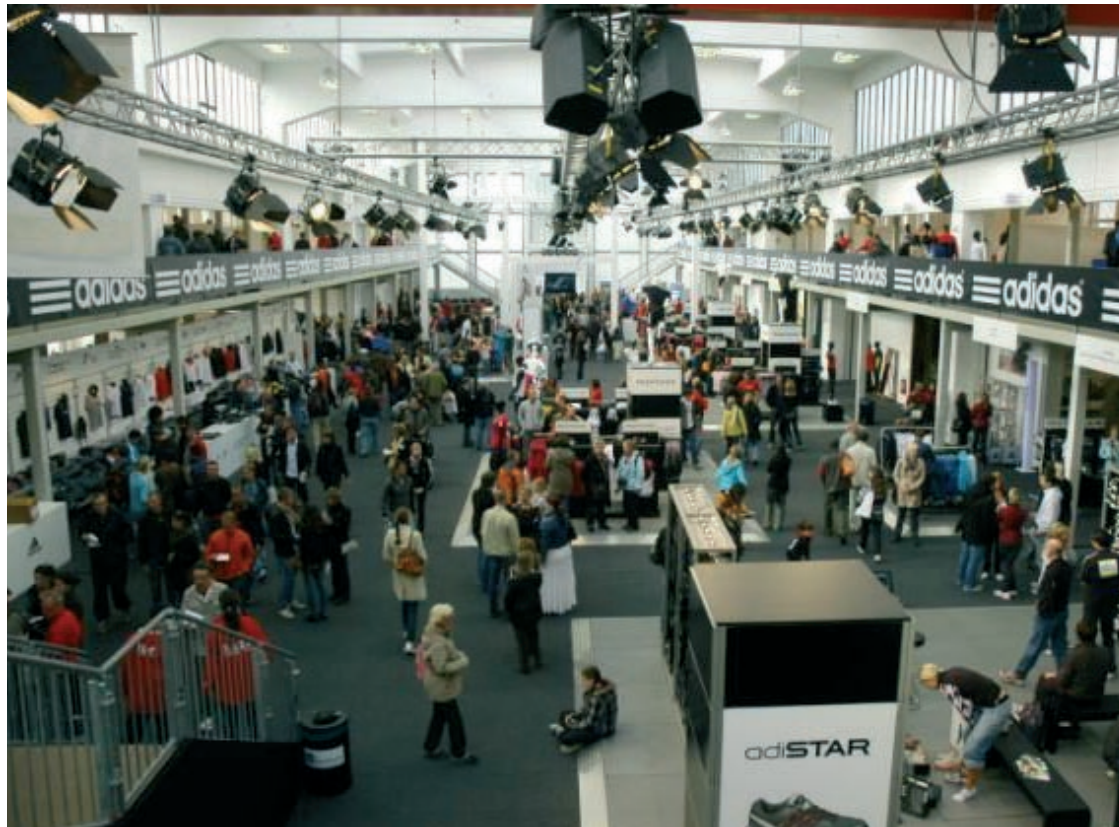
Adidas Berlin Marathon // 2800 m 2 2008 Berlin - Germany