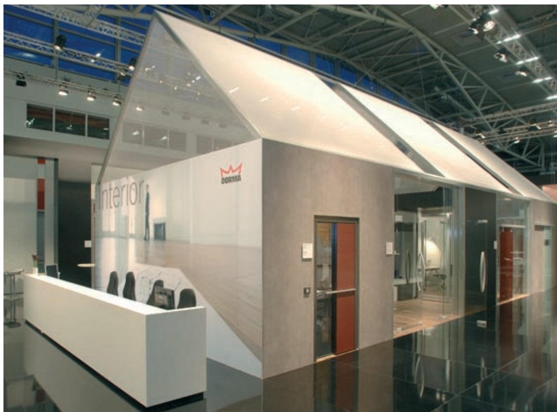
Dorma Bau Halle C4 // 400m 2 2009 Munich - Germany