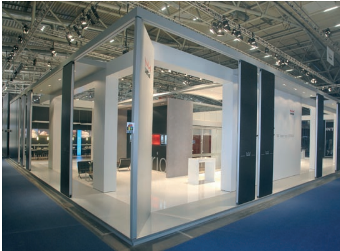
Dorma Bau Hall B1// 540 m 2 2009 Munich - Germany