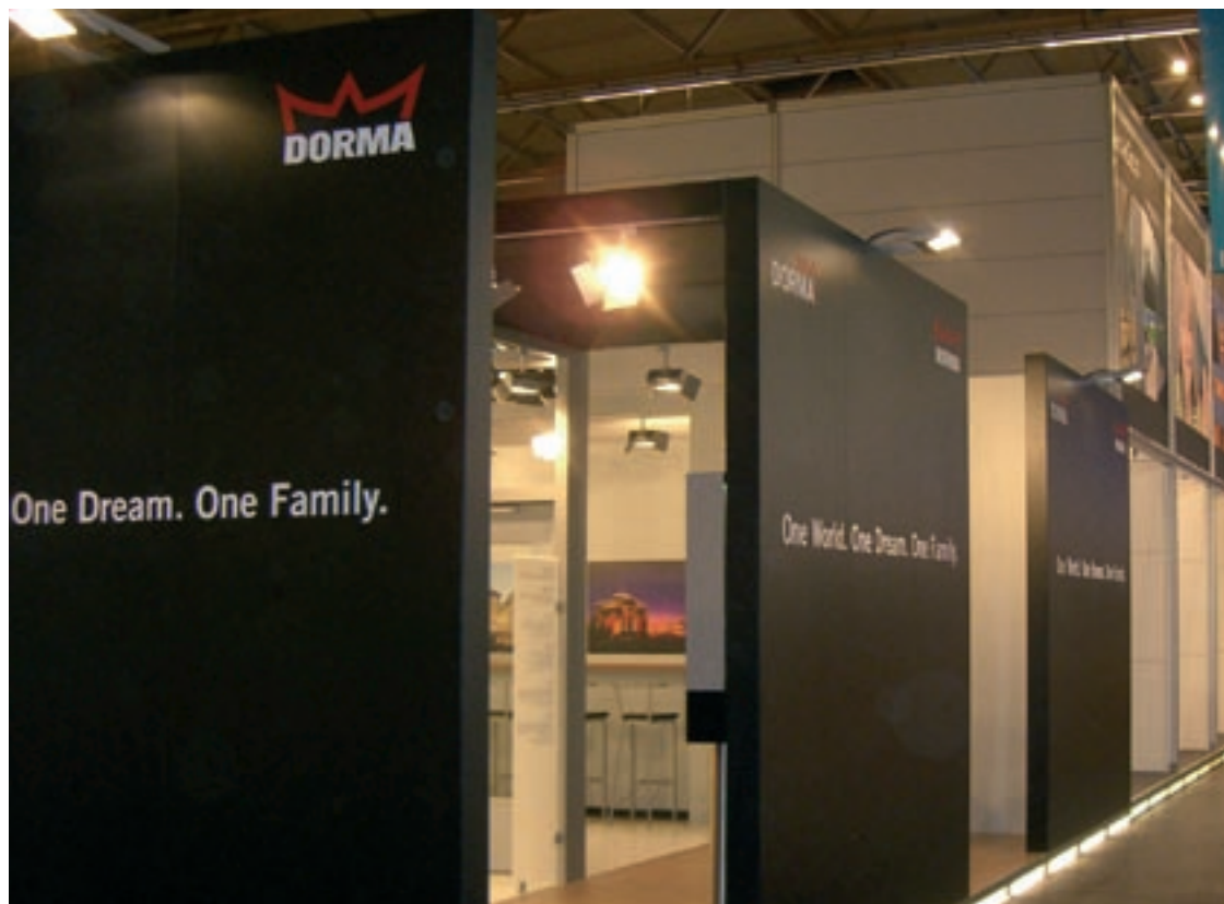
Dorma Polyclose // 110m 2 2008 Gent - Belgium